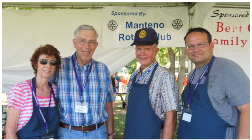
Middle Right (above): Manteno Rotary Club