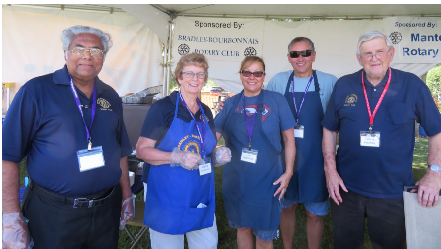
Left: Bradley Bourbonnais Rotary Club