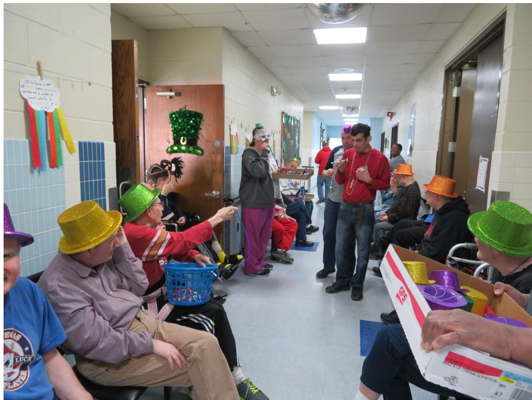
Celebrating Mardi Gras...would you like beads? Or a hat? Or a noise maker? Or a mask?