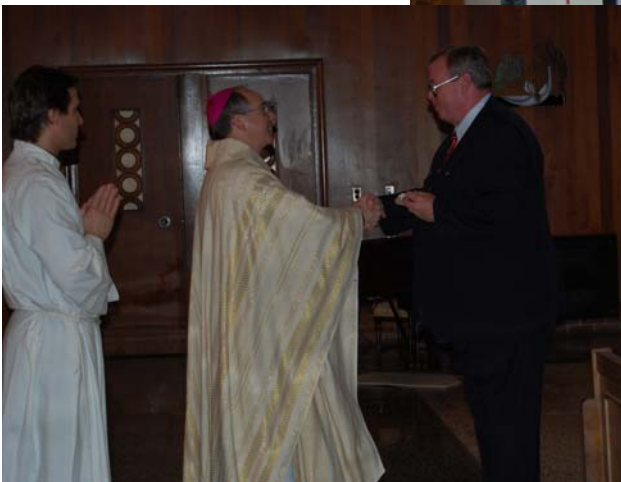
Top to Bottom: Bishop Sartain and concelebrating priests conduct the Mass of Thanksgiving at Good Shepherd Manor on May 7, 2009.